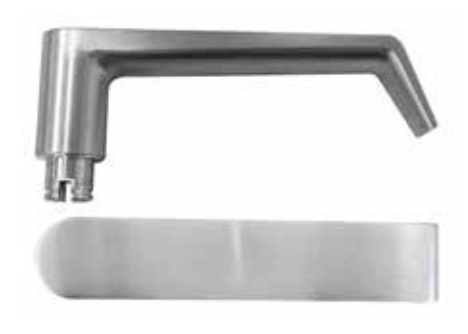
Art ID: 32LEVER-SCP