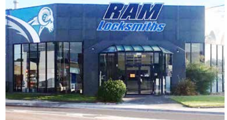
RAM Locksmiths (2019 SOTY Winner)

1. Extra points awarded for innovative/creative ideas